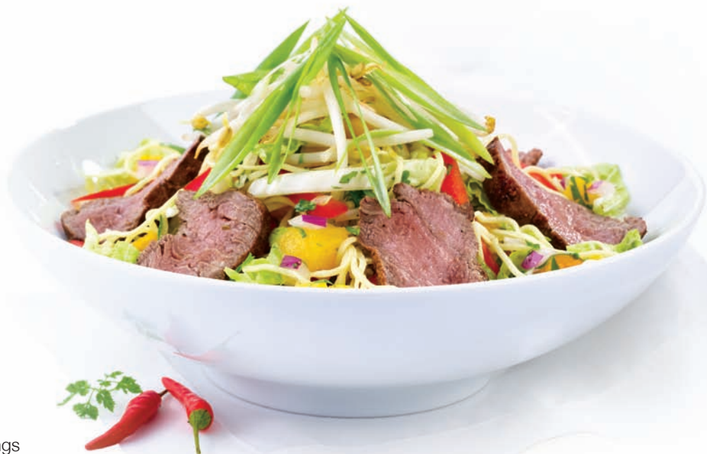
Thai Tenderloin Salad

Crisp iceberg lettuce topped with grilled seasoned chicken breast, green onions, tomatoes, Cheddar cheese, cucumbers, egg and bacon bits. Served with blue cheese or ranch dressing on the side. $12.99