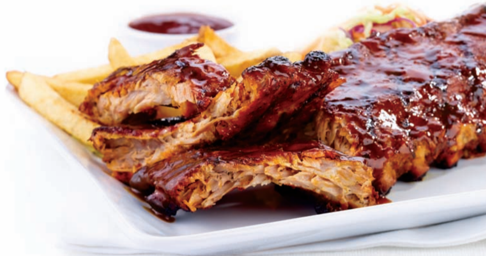
Casey's Famous Back Ribs

A quarter rotisserie chicken breast and a half rack of our mouth-watering slow-roasted back ribs. Comes with fries, slaw and hot chicken BBQ dipping sauce. Leg $21.99