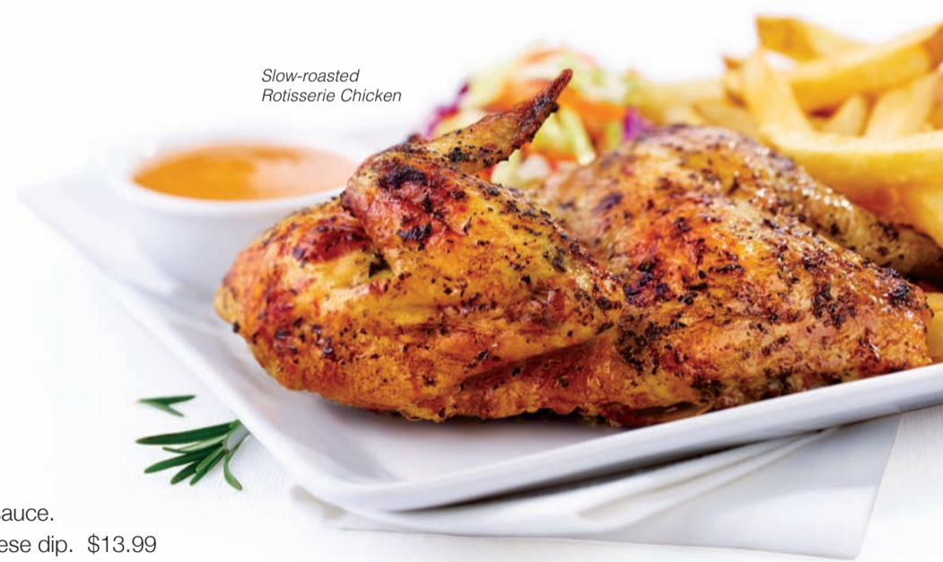
Slow-roasted Rotisserie Chicken

Buffalo – Coated in your choice of mild, medium or hot wing sauce. Served with fries, carrots and celery sticks, slaw and Blue cheese dip. $13.99