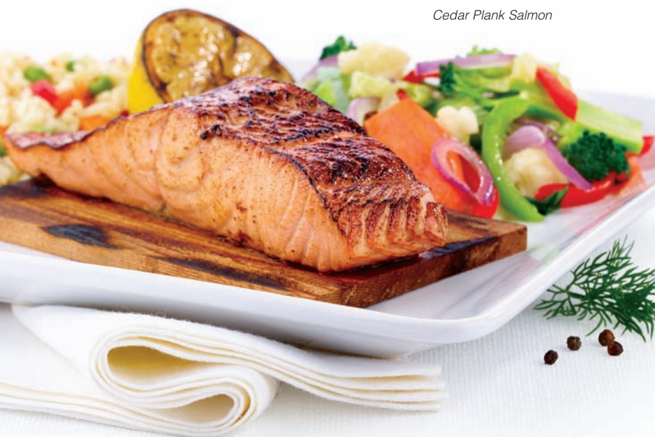
Cedar Plank Salmon

Crisp tempura-battered cod served with slaw, tartar sauce and fries seasoned with sea salt. Double. $13.99 Single. $10.99